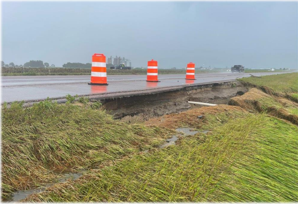
Figure 9 - I-90 near Magnolia