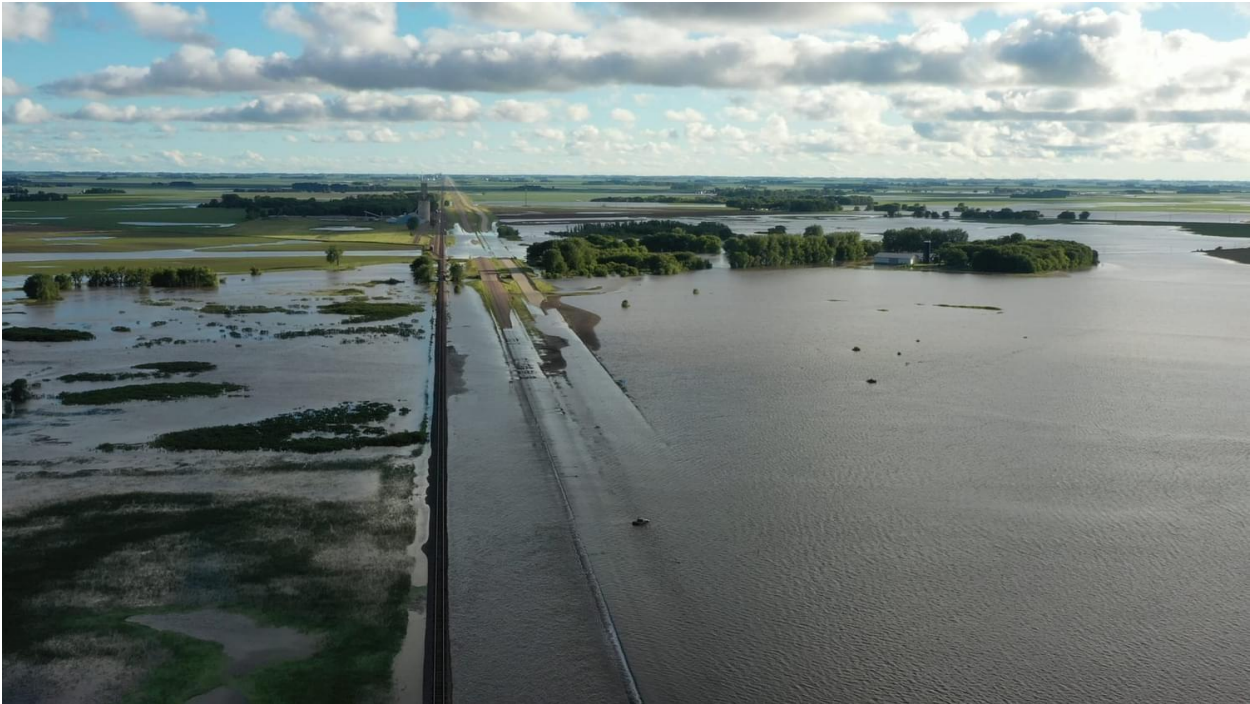
Figure 4 - Waterville, MN