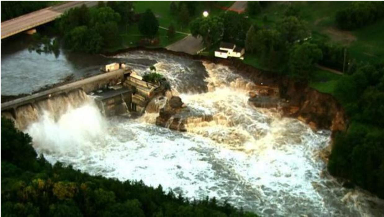
Figure 7 - Rapidan Dam, MN