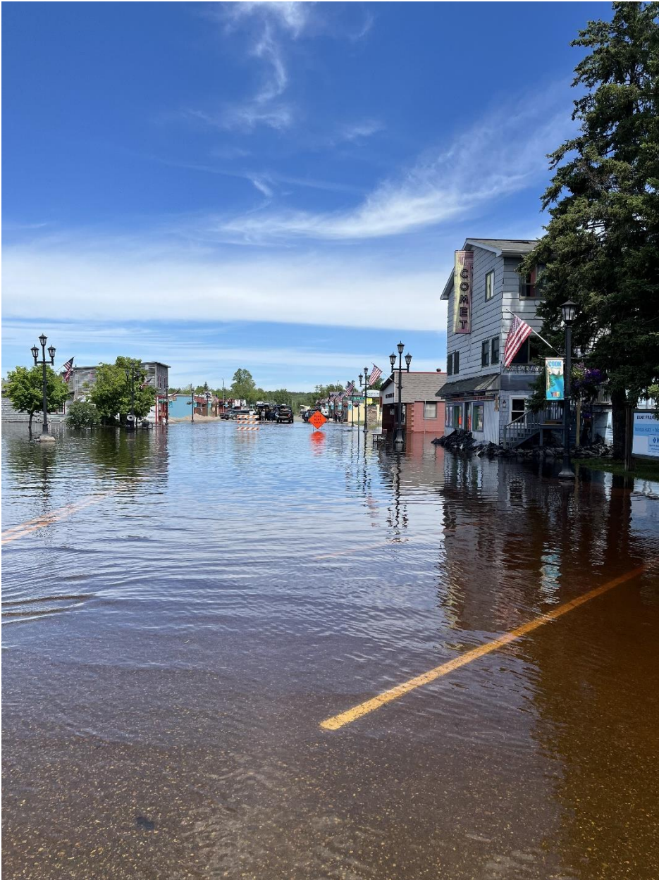
Figure 1-Cook, MN