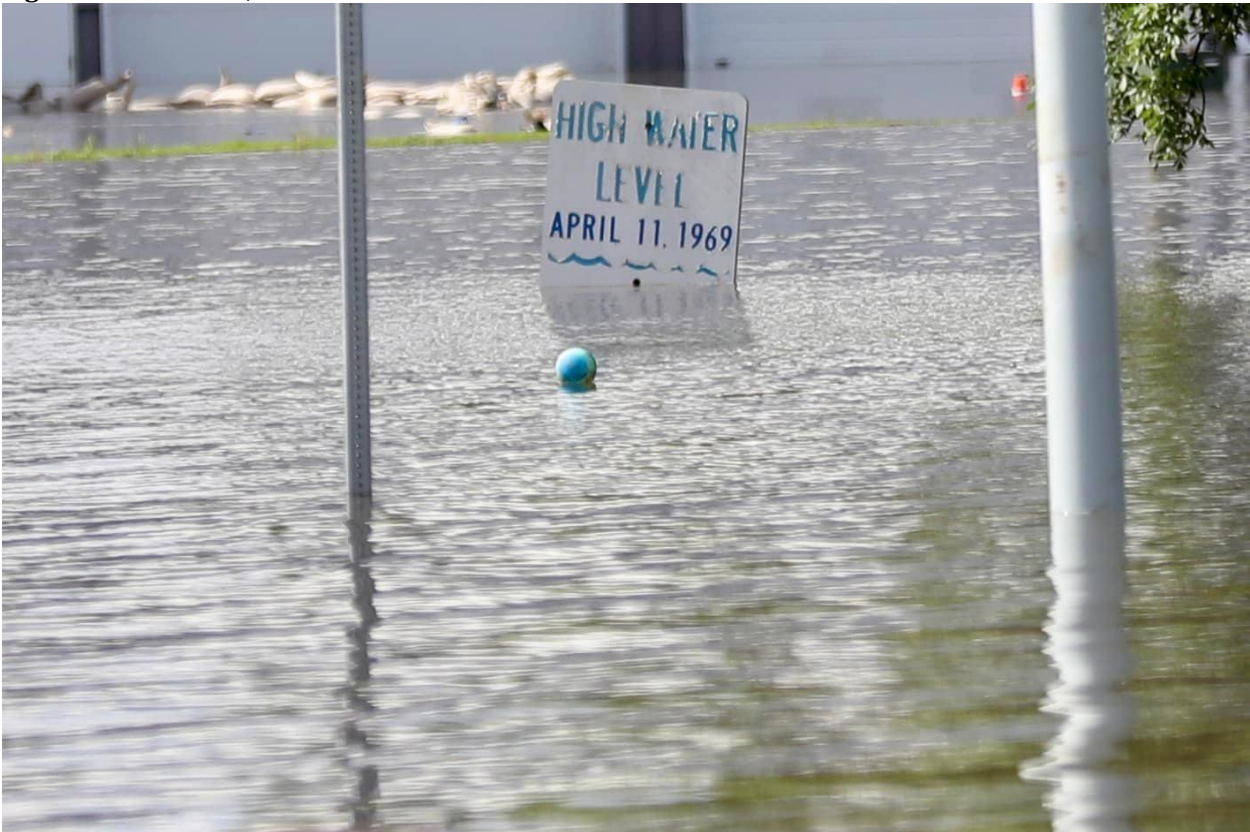
Figure 5 - Waterville, MN