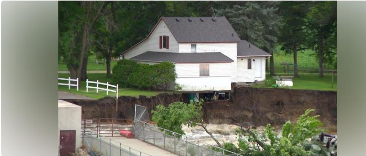
Figure 8 - Rapidan Dam