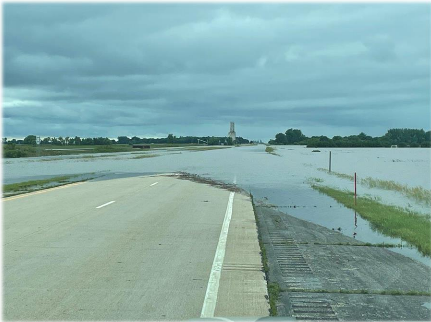
Figure 10 - Highway 60 near Heron Lake