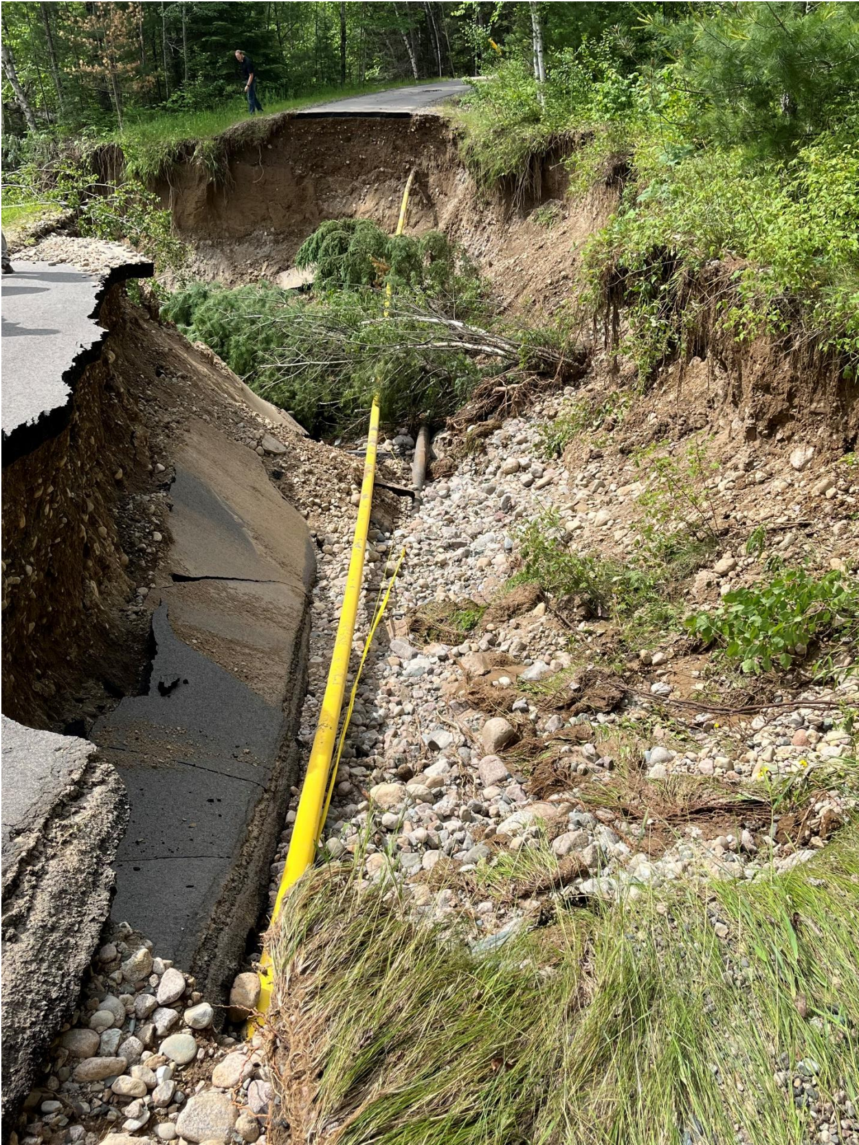
Figure 3 - Near Biwabik, MN

130 State Capitol · 75 Rev. Dr. Martin Luther King Jr. Blvd · Saint Paul, MN | mn.gov/governor (651) 201-3400 or (800) 657-3717 | MN Relay: (800) 627-3529 | Fax: (651) 797-1850