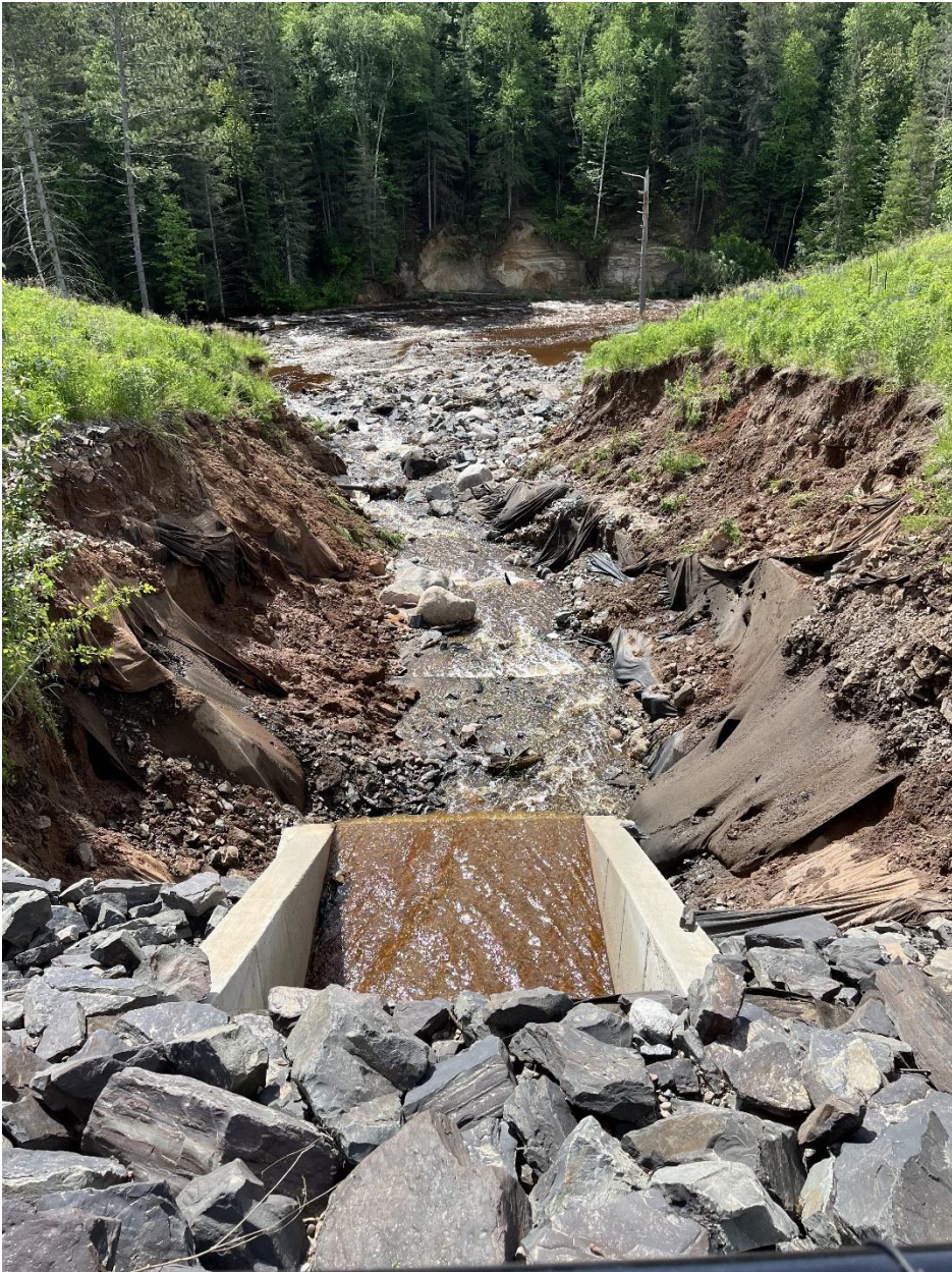
Figure 2 - Near Biwabik, MN