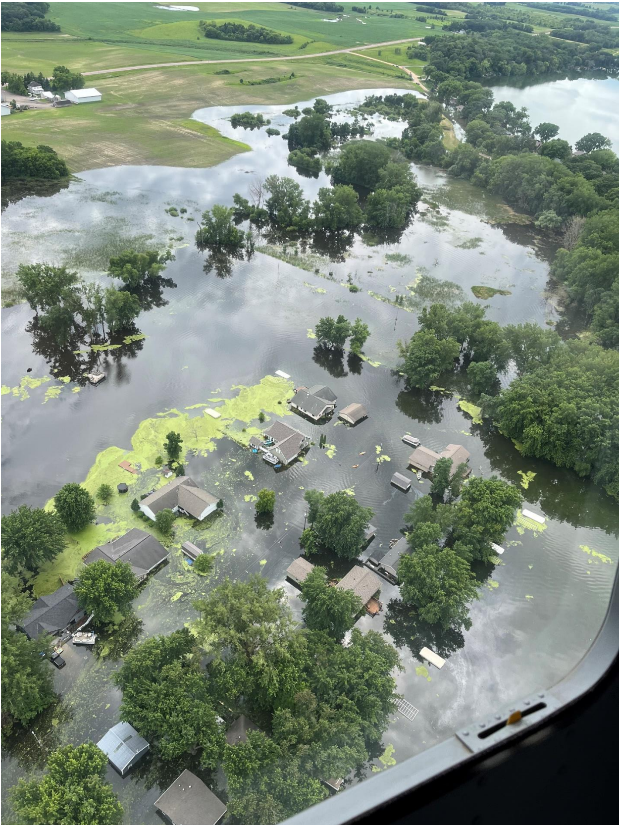
Figure 6 - Waterville

130 State Capitol · 75 Rev. Dr. Martin Luther King Jr. Blvd · Saint Paul, MN | mn.gov/governor (651) 201-3400 or (800) 657-3717 | MN Relay: (800) 627-3529 | Fax: (651) 797-1850 An Equal Opportunity Employer State government printed on recycled paper containing 15% post-consumer material.