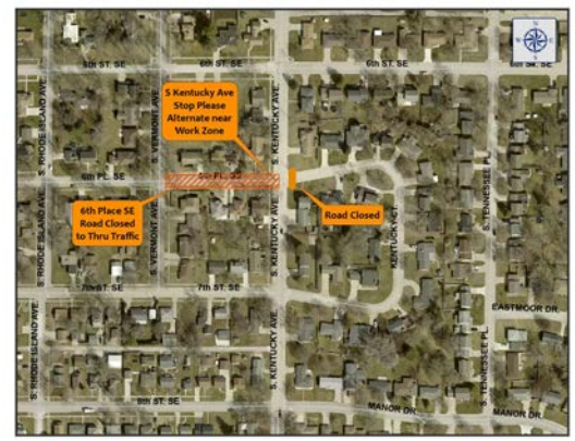
South Kentucky Avenue

The southbound lane of S. Kentucky Avenue will be closed, using a 'stop please alternate' sign around the work zone. Also in this area, 6<sup>th</sup> Place SE and Kentucky Court will be closed to through traffic. The duration of this closure is approximately 1 week.