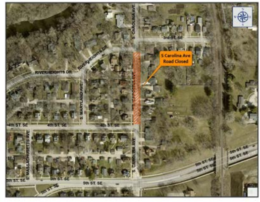
South Carolina Avenue between 3^{rd}/4^{th} Streets SE

Weather permitting, South Carolina Avenue between 3<sup>rd</sup> and 4<sup>th</sup> Streets SE will be closed for approximately 2 weeks.